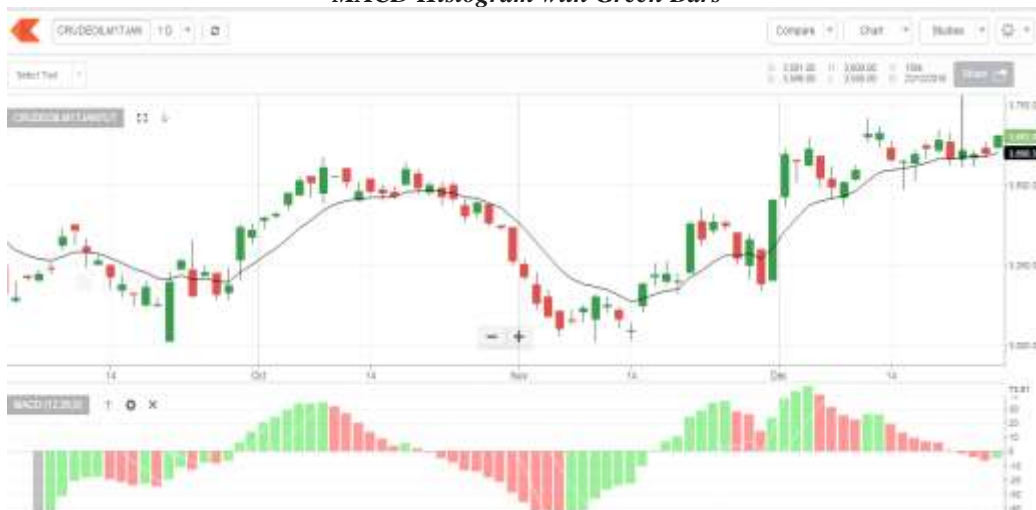
MACD Histogram with Green and Red Bars